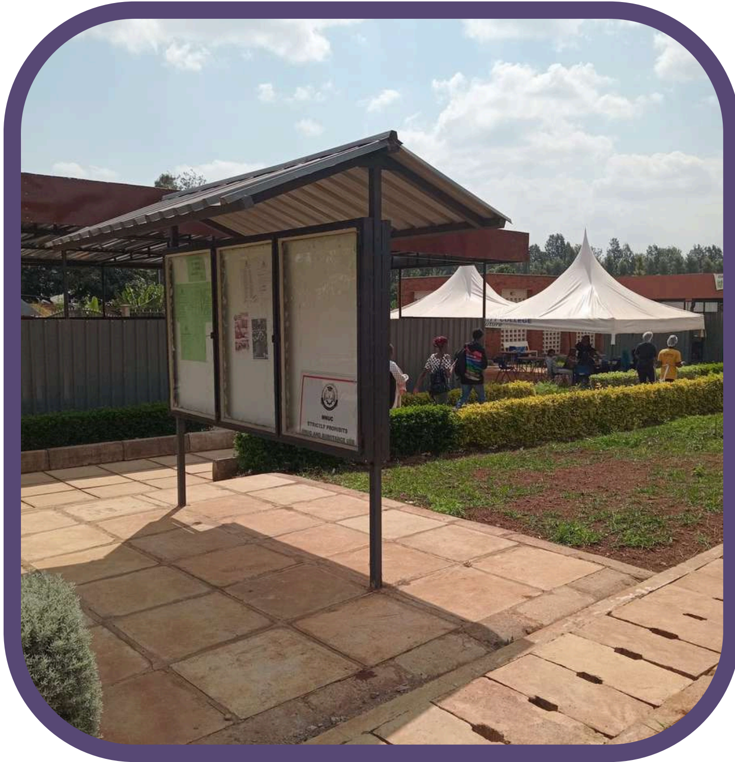
Notice board between the lecture theatre, cafeteria and Tuition Block