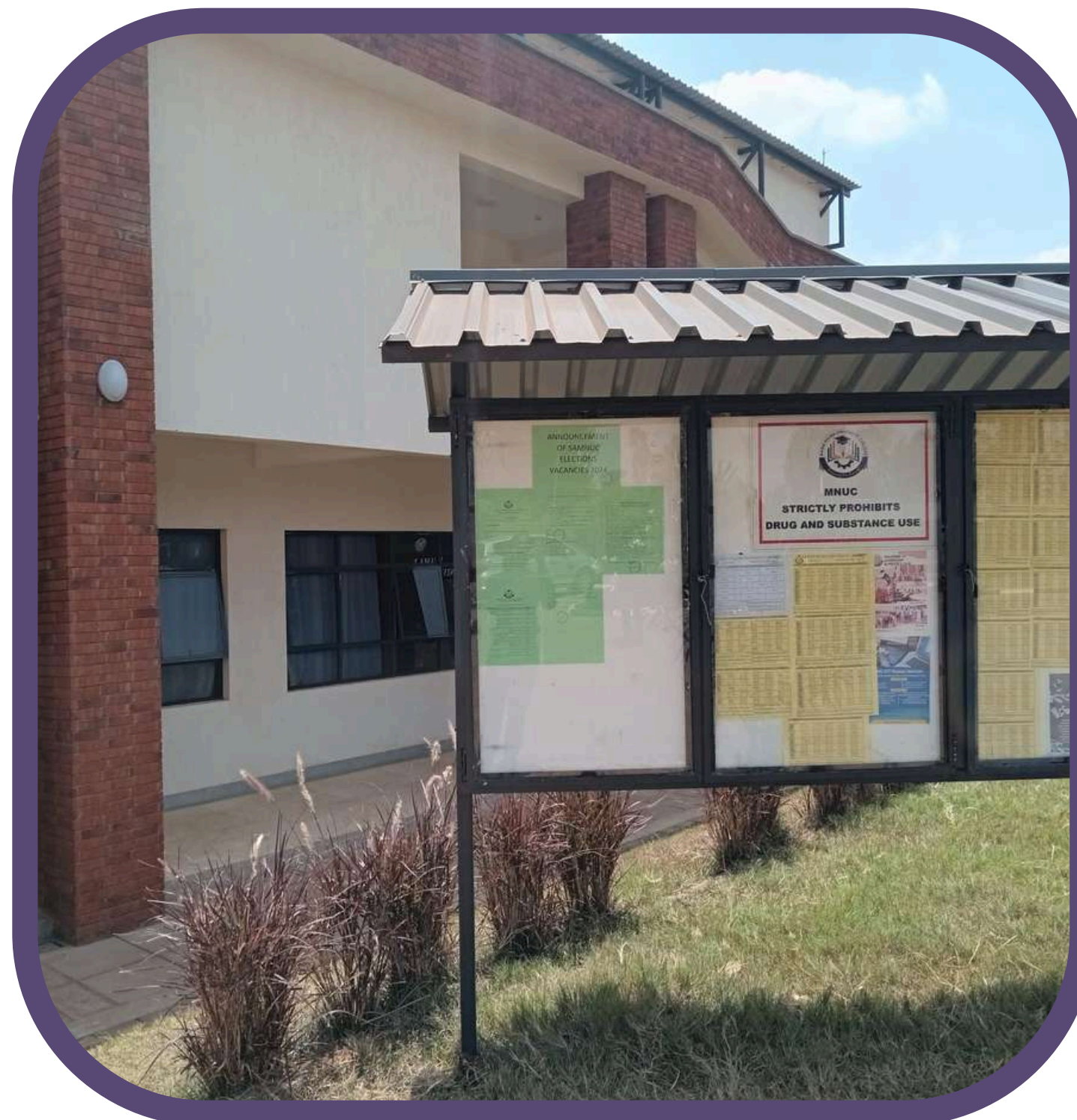
Notice board near the entrance of the office of student Affairs and Outreach.